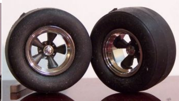
Sample Pictures Tires are by American Satco

Order your finished set of these Torque rims and tires for only $19.99